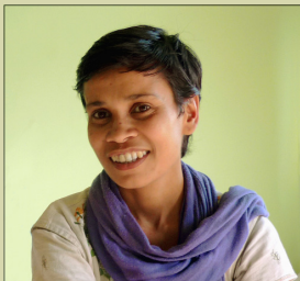
Pompy completed the Indian Institute of Plantation Mgt's "Certificate Program in Tea Tasting & Marketing"