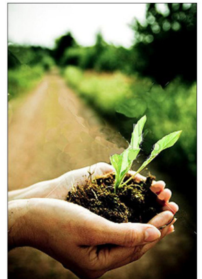
Identifying and developing key skills and resources for educators, farmers and students

A Demonstration Garden and Vocational Training Project in Jorhat, Assam