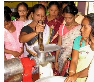
Equipment & Tools for New Entrepreneurs Projects

“The greatest constraints to growers who are shifting to more sustainable practices are the lack of knowledge, information sources and technical support.”