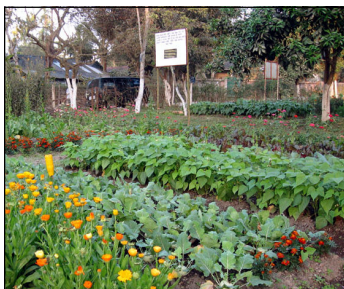
Tools, Seeds & Supplies for the Demonstration Garden

Your contribution will support the services provided at Adarsh Seuj Prakalkpa in Assam, and help move the project towards greater self-sufficiency and sustainability.