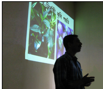
Training & Outreach at the Resource Centre & in the field